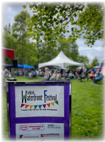
Selkirk Waterfront Festival brings over 1500 community members together every year

BC Housing; Capital Regional District; City of Victoria; Employment & Social Development Canada; Island Health; Ministry of Children & Family Development; Ministry of Tourism, Arts, Culture and Sport; Public Health Agency of Canada; School District 61