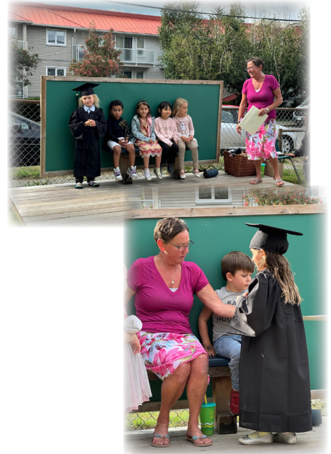
Tillicum Daycare 2024 Grad Ceremony

Tillicum Daycare offers 16 spots for children aged 2.5 to 5 years old, providing a structured yet playful setting that supports early learning, social development, and school readiness. In August 2024, the daycare celebrated a milestone as it proudly graduated its first group of children, preparing them for their transition into kindergarten.