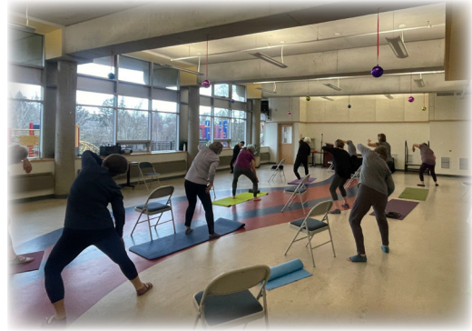
program participants at the Essentrics class

A variety of recreation programs and special events were offered throughout the year. Special events included the Gorge Waterway Cleanup where community members, school groups and outdoor enthusiasts came out to clean up our community's shoreline. In May 2023, BGCA hosted the Selkirk Waterfront Festival seeing more than 1500 visitors enjoy music and family-friendly activities. Recreation programs offered registered and drop-in Zumba, Yoga and Essentrics classes.