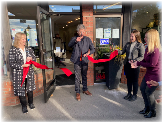
Burnside Boutique ribbon cutting ceremony

After months of planning and renovations, Burnside Boutique proudly opened its doors to the community of thrift store enthusiasts in September 2022 and marked this exciting accomplishment with a grand opening in December. The event kicked off with a joyous ribbon-cutting ceremony attended by generous supporters and donors. Since its inception, Burnside Boutique has achieved notable milestones, including the successful launch of its first online auction. The boutique continues to thrive, experiencing growth in both volunteer support and strategic partnerships, including collaborations with consignment stores that contribute regular donations. During the last year, the boutique 2 staff and 10 volunteers have created a real gem in the community. Stay informed about Burnside Boutique's latest activities by following their social media channels. (see below)