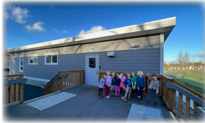
Students in front of the Tillicum Child Care Centre

September 2021 marked the opening of the Tillicum Child Care Centre, providing an additional 36 new before and after school care spaces at Tillicum School. This increased BGCA's out of school care spaces over four locations for both Tillicum and Quadra Schools to 145 spaces. The capacity for winter, spring and summer camp spaces are also increased to 44 spaces from 22.