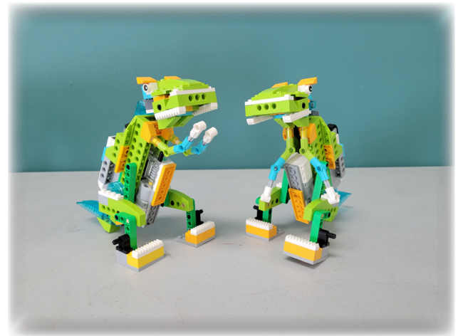
Children work at Lego Robotics STEM program