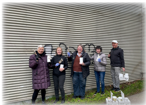
Graffiti Fighters removing graffiti from our neighbourhood

BC Housing; Capital Regional District; City of Victoria; Employment & Social Development Canada; Island Health, Ministry of Children & Family Development; Ministry of Tourism, Arts, Culture and Sport; Public Health Agency of Canada; School District 61