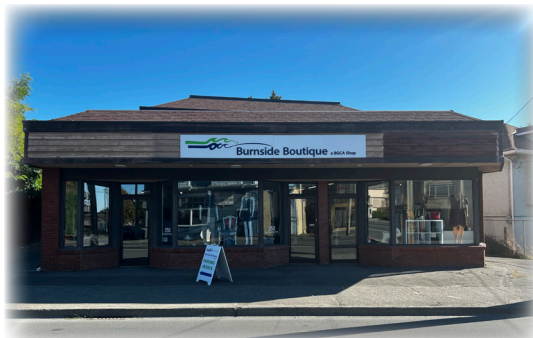
Burnside Boutique from the front