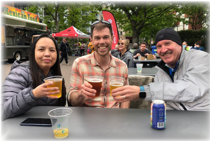
Visitors enjoying beer garden at the Selkirk Waterfront Festival