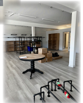
Burnside Boutique during construction