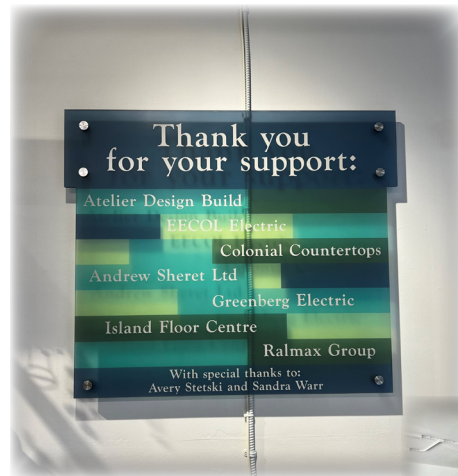
Thank you wall for the supporters at the Burnside Boutique