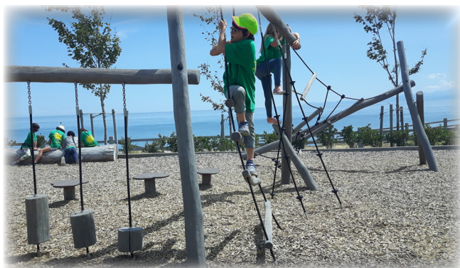
Fun n' Sun Camp enjoying a sunny day at the beach.