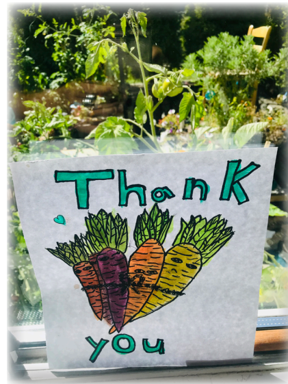
A note of thanks from a child whose family received fresh veggies through BGCA's hamper program.