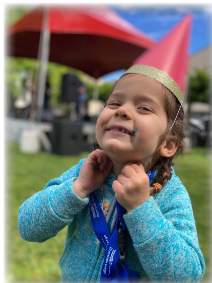
A child celebrates BGCA's 30th at the Selkirk Waterfront Festival