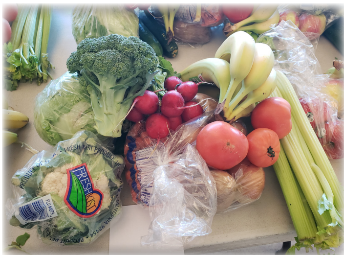
Produce waiting to be packed up into food hampers

Another quick pivot was the expansion of food security programming. Through the generosity of community funding and government grants we were able to launch a food hamper and meal delivery program through the spring and early summer. Accessing excess food and fresh produce from partners like School District 61 and the Victoria Food Share Network as well as purchasing bulk goods allowed us to provide 817 food hampers to families and seniors as well as 253 meals provided through delivery and pick up.