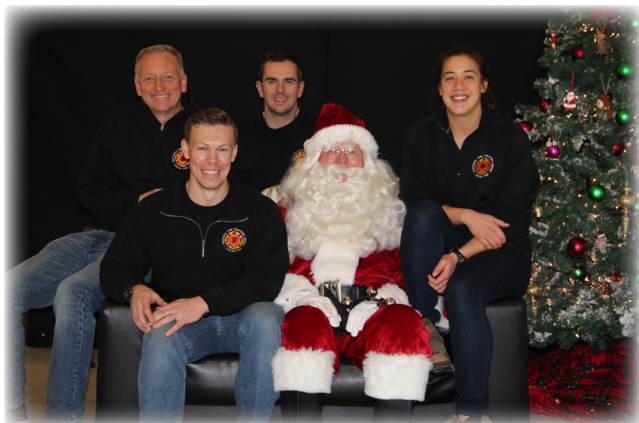
Victoria Firefighters take a break from flipping flapjacks at our 2019 Santa's Pancake Breakfast!

BC Housing, Capital Regional District, City of Victoria, Employment & Social Development Canada, Island Health, Min. of Children & Family Development, Min. of Municipal Affairs & Housing, Public Health Agency of Canada, School District 61