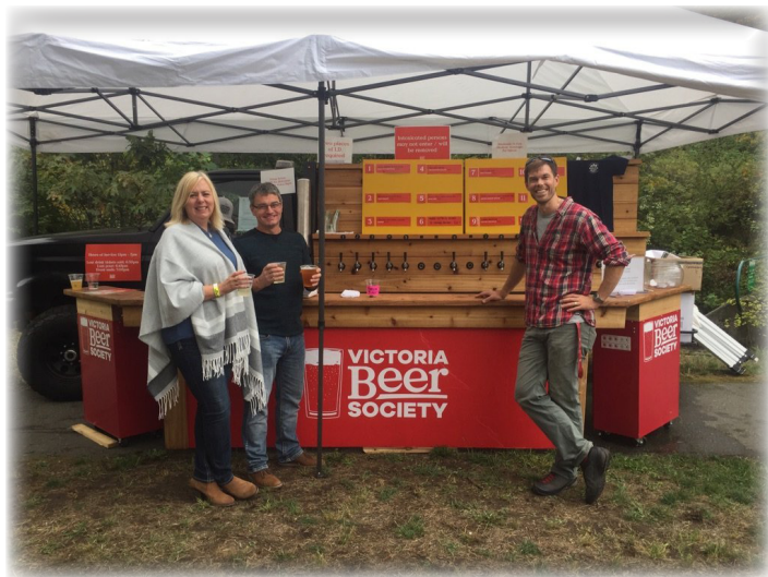
Guests enjoying the Cecelia Ravine Backyard Party

Reflecting on the work of this past year it is difficult not to solely focus on BGCA's response during the COVID-19 pandemic and remember to highlight other accomplishments during the first half of our fiscal year. September of 2019 saw our first ever Cecelia Ravine Backyard Party, an exciting partnership with Victoria Beer Society, to bring new opportunities for community celebration to Burnside Gorge. We were also conducting an engagement survey of businesses in the neighbourhood to better understand their specific needs and strengthen relationships. New programming was being developed to support accessible dance as well as planning for the 20th year of our Selkirk Waterfront Festival. No one could have anticipated what this year would look like come March.