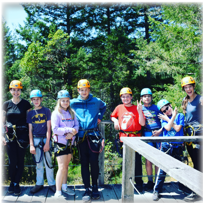
The Camp Survivor crew on a zipline adventure!