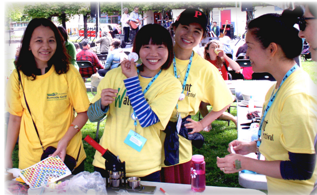
Volunteers with the 2019 Selkirk Waterfront Festival

Children and youth made over 3700 visits to lunch hour and after school recreation activities improving their physical health and social skills.