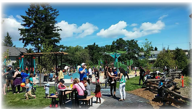
The grand opening of the newly renovated playspace in Cecelia Ravine Park!

BC Housing, Capital Regional District, City of Victoria, Employment & Social Development Canada, Island Health, Min. of Children & Family Development, Min. of Municipal Affairs & Housing, Public Health Agency of Canada, School District 61