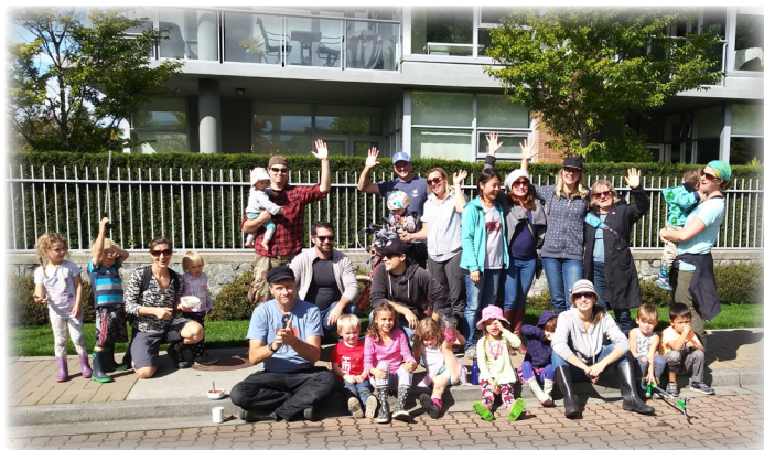
The Junior Forest Wardens at the 2018 Gorge Waterway Cleanup!

We couldn't do the work that we do without the support and dedication of our amazing volunteers. In 2018/2019 we had more than 300 volunteers including our Board of Directors, reception & newsletter support, and all of our community events and celebrations. Collectively they contributed more than 3600 hours in service of the community.