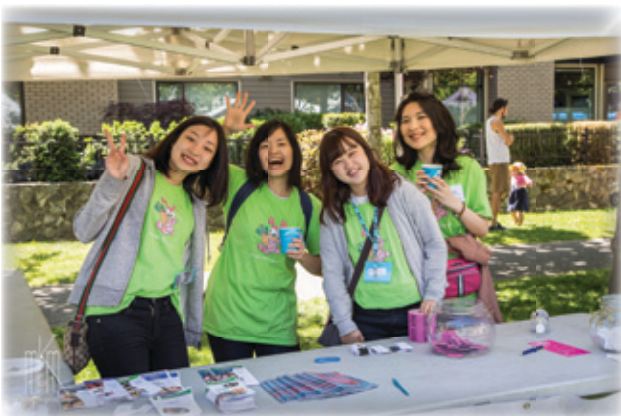
Volunteers with the 2018 Selkirk Waterfront Festival

BC Housing, Capital Regional District, City of Victoria, Employment & Social Development Canada, Island Health, Min. of Community, Sport, & Cultural Development, Min. of Children & Family Development, Public Health Agency of Canada, School District 61