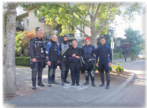
The Aquarius Dive Club at the 2017 Gorge Waterway Cleanup.

3000+ people attended special events such as Gorge Waterway Clean up, Monster Mash, Santa's Pancake Breakfast and the Selkirk Waterfront Festival.