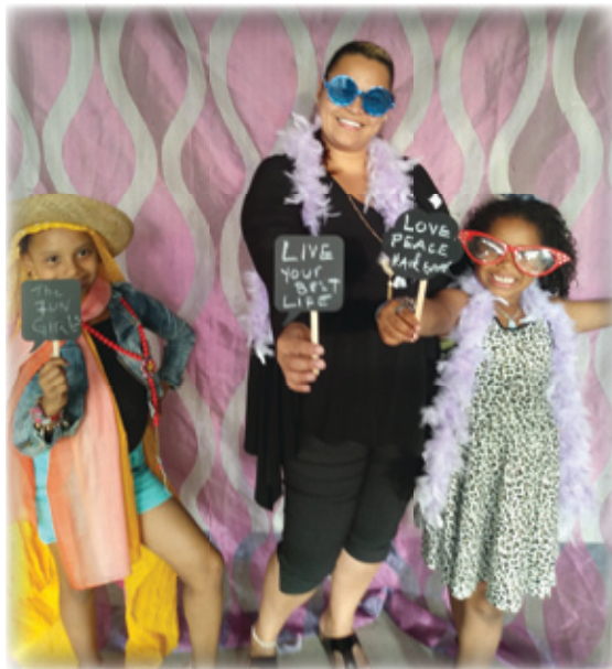
An FSS Graduate celebrating with her family.