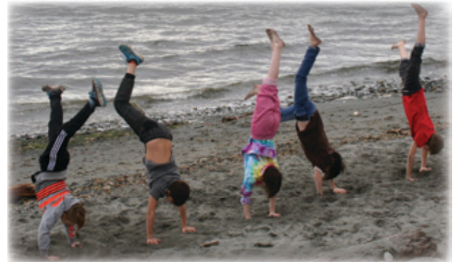
Youth practicing their skills at a Camp Survivor outing.

Children and youth made over 2000 visits to lunch hour and after school recreation activities improving their physical health and social skills.