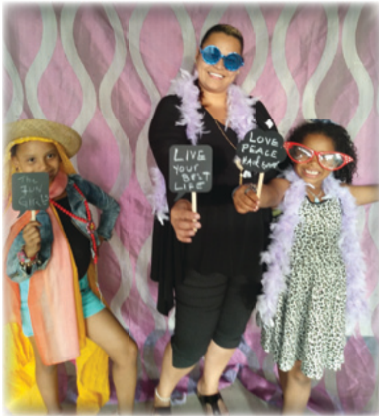
An FSS Graduate celebrating with her family.

137 families received intensive parenting and family support through the C'nex Parenting Program and family outreach.